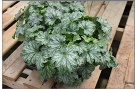
Paris Coral Bells foliage

Paris Coral Bells will grow to be about 8 inches tall at maturity extending to 14 inches tall with the flowers, with a spread of 14 inches. When grown in masses or used as a bedding plant, individual plants should be spaced approximately 12 inches apart. Its foliage tends to remain low and dense right to the ground. It grows at a medium rate, and under ideal conditions can be expected to live for approximately 10 years. As an evergreen perennial, this plant will typically keep its form and foliage year-round.