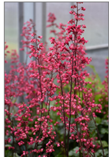
Paris Coral Bells flowers