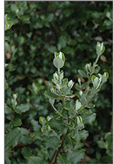
James Roof Silk Tassel Bush foliage