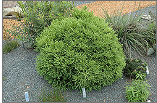
Little Diamond Japanese Cedar