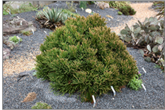
Little Diamond Japanese Cedar

Little Diamond Japanese Cedar makes a fine choice for the outdoor landscape, but it is also well-suited for use in outdoor pots and containers. It can be used either as 'filler' or as a 'thriller' in the 'spiller-thriller-filler' container combination, depending on the height and form of the other plants used in the container planting. It is even sizeable enough that it can be grown alone in a suitable container. Note that when grown in a container, it may not perform exactly as indicated on the tag - this is to be expected. Also note that when growing plants in outdoor containers and baskets, they may require more frequent waterings than they would in the yard or garden.