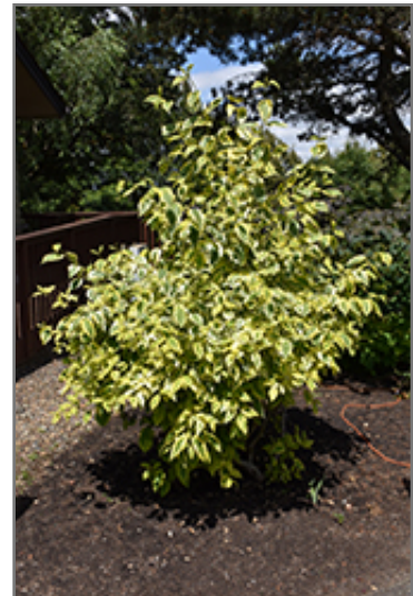
Hedgerows Gold Variegated Red-Twig Dogwood