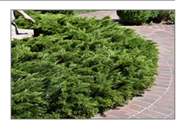
Calgary Carpet Juniper

Calgary Carpet Juniper will grow to be about 24 inches tall at maturity, with a spread of 7 feet. It tends to fill out right to the ground and therefore doesn't necessarily require facer plants in front. It grows at a slow rate, and under ideal conditions can be expected to live for approximately 30 years.