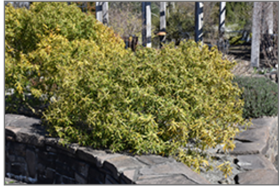
Aztec Pearl Mexican Mock Orange

This plant is not reliably hardy in our region, and certain restrictions may apply; contact the store for more information.