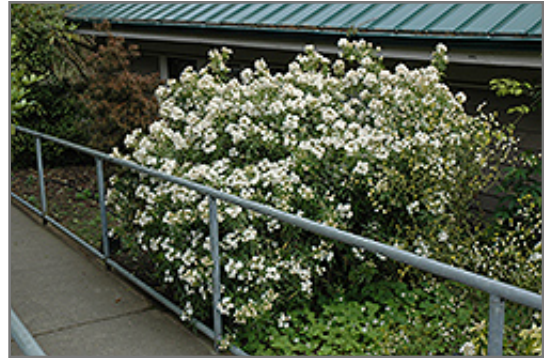
Aztec Pearl Mexican Mock Orange in bloom