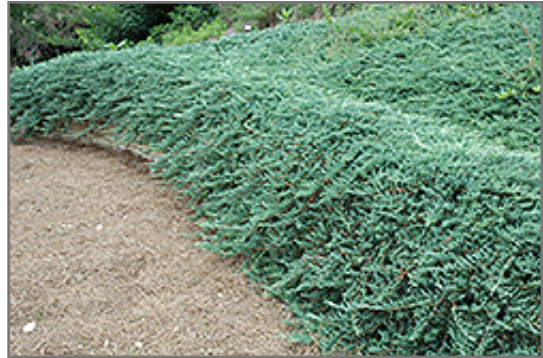
Bar Harbor Juniper