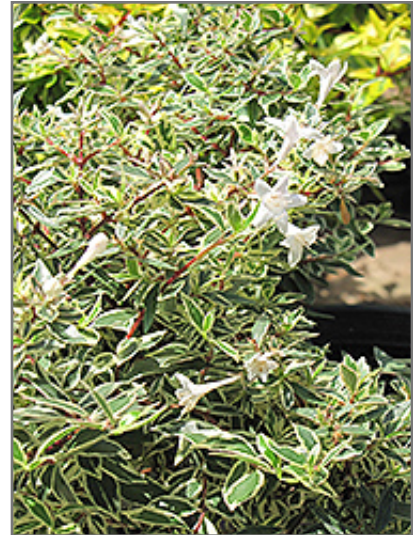
Confetti Abelia in bloom