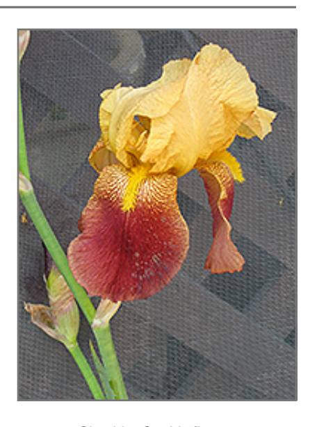
Cheshire Cat Iris flowers