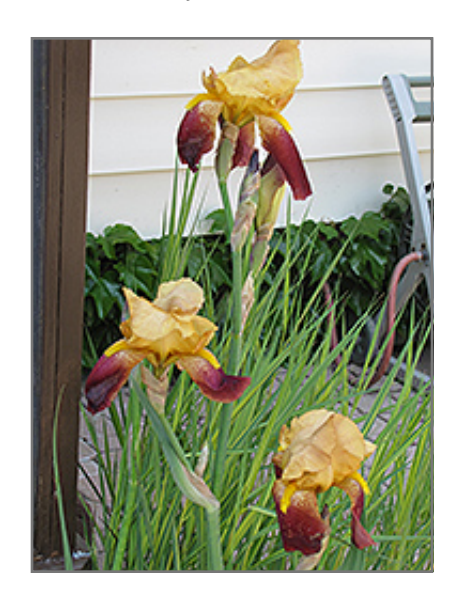
Cheshire Cat Iris flowers