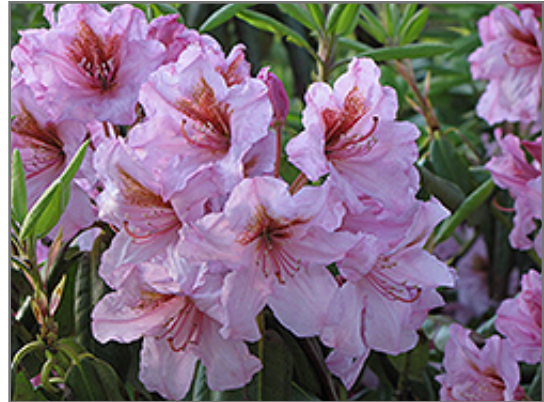
Kabarett Rhododendron flowers