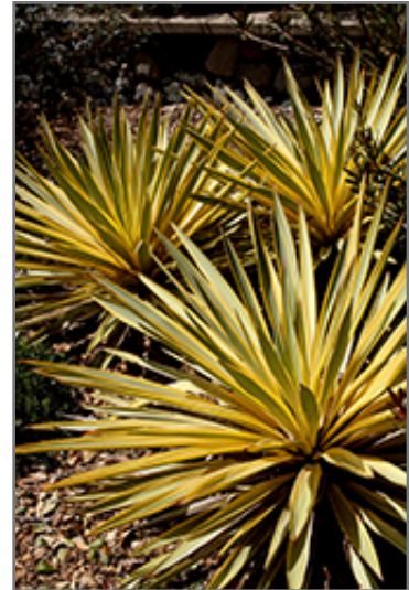
Bright Star Yucca

Bright Star Yucca is recommended for the following landscape applications;