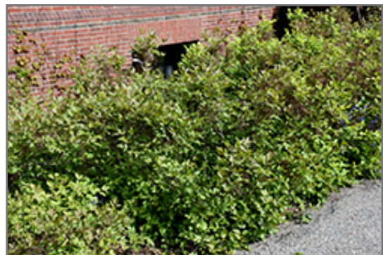
Shrub Yellowroot