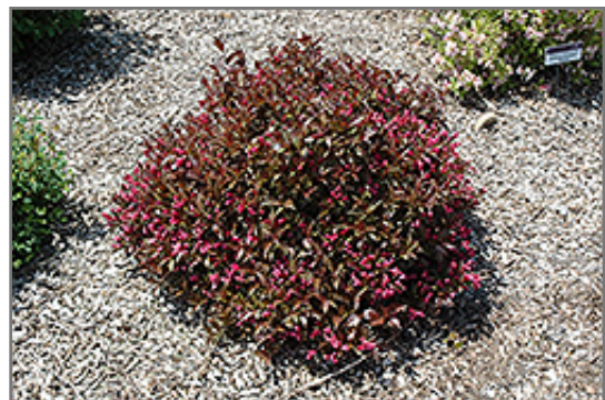
Shining Sensation Weigela in bloom