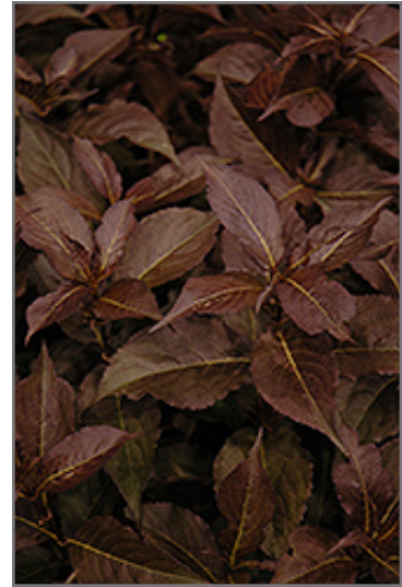
Shining Sensation Weigela foliage

This shrub should only be grown in full sunlight. It prefers to grow in average to moist conditions, and shouldn't be allowed to dry out. It is not particular as to soil type or pH. It is highly tolerant of urban pollution and will even thrive in inner city environments. This is a selected variety of a species not originally from North America.