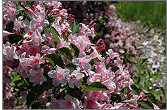
Boskoop Glory Weigela flowers