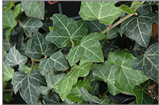
Baltic Ivy foliage