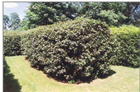
Hedge Maple