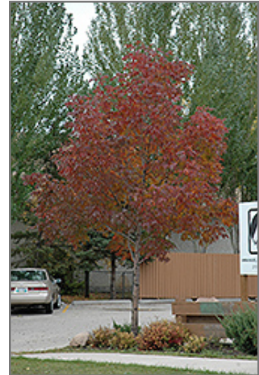
Northern Blaze White Ash in fall