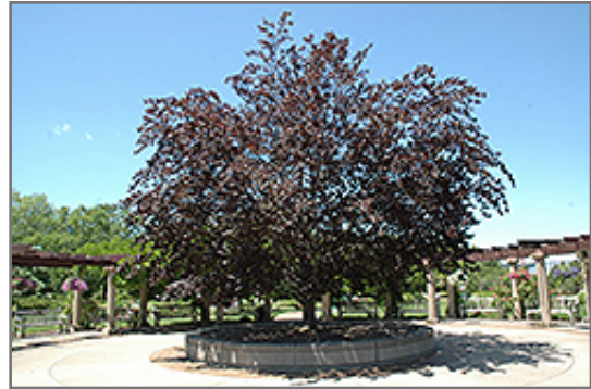
Purple Beech