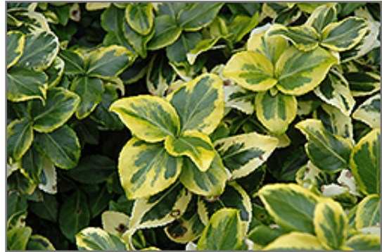
Gold Prince Wintercreeper foliage