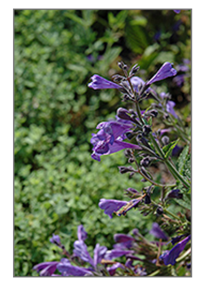
Blue Dragon Catmint flowers