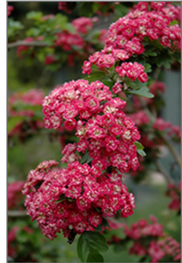
Toba Hawthorn flowers