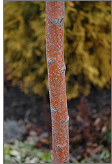
Toba Hawthorn bark

This tree does best in full sun to partial shade. It is very adaptable to both dry and moist growing conditions, but will not tolerate any standing water. It is not particular as to soil type or pH. It is somewhat tolerant of urban pollution. This particular variety is an interspecific hybrid.