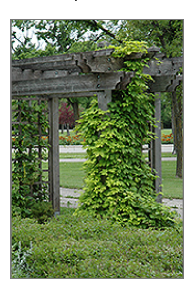
Nugget Ornamental Golden Hops