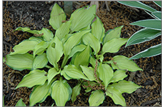
Cracker Crumbs Hosta

Cracker Crumbs Hosta is recommended for the following landscape applications;