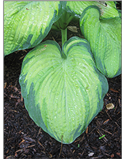
Color Glory Hosta foliage