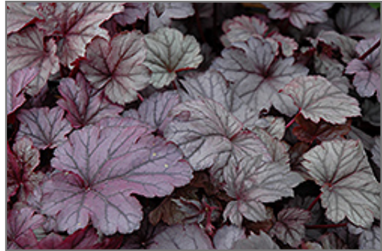
Shanghai Coral Bells foliage