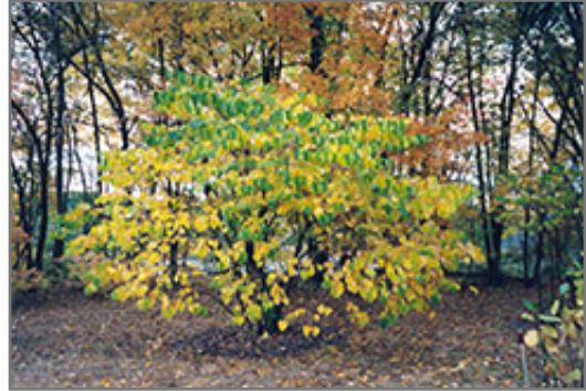
Northern Strain Redbud in fall

This tree does best in full sun to partial shade. It prefers to grow in average to moist conditions, and shouldn't be allowed to dry out. It is not particular as to soil type or pH. It is highly tolerant of urban pollution and will even thrive in inner city environments, and will benefit from being planted in a relatively sheltered location. Consider applying a thick mulch around the root zone in winter to protect it in exposed locations or colder microclimates. This is a selection of a native North American species.