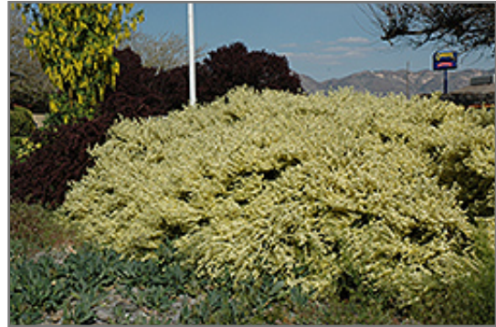
Moonlight Scotch Broom in bloom

Moonlight Scotch Broom is recommended for the following landscape applications;