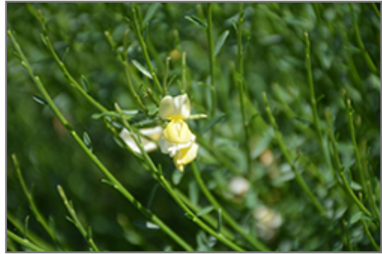
Moonlight Scotch Broom flowers

This shrub should only be grown in full sunlight. It prefers dry to average moisture levels with very well-drained soil, and will often die in standing water. It is considered to be drought-tolerant, and thus makes an ideal choice for xeriscaping or the moisture-conserving landscape. It is particular about its soil conditions, with a strong preference for clay, alkaline soils, and is able to handle environmental salt. It is highly tolerant of urban pollution and will even thrive in inner city environments. This is a selected variety of a species not originally from North America.