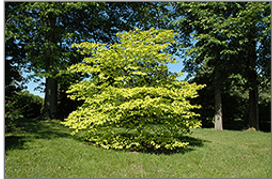
Golden Nugget Flowering Dogwood

Golden Nugget Flowering Dogwood is recommended for the following landscape applications;