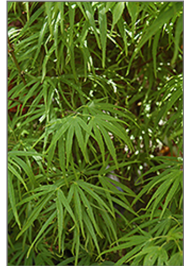
Scolopendrifolium Japanese Maple foliage

Scolopendrifolium Japanese Maple is recommended for the following landscape applications;