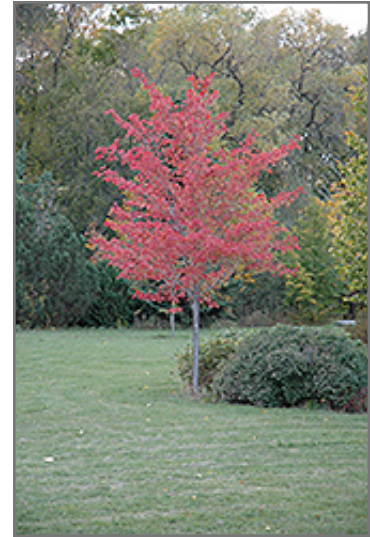
Northfire Red Maple in fall

This tree should only be grown in full sunlight. It is quite adaptable, preferring to grow in average to wet conditions, and will even tolerate some standing water. It is not particular as to soil type, but has a definite preference for acidic soils, and is subject to chlorosis (yellowing) of the foliage in alkaline soils. It is somewhat tolerant of urban pollution. This is a selection of a native North American species.