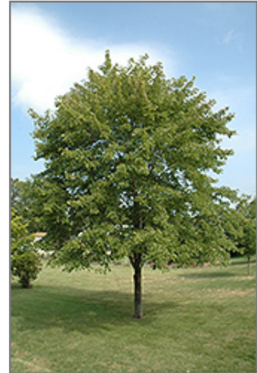
Northfire Red Maple