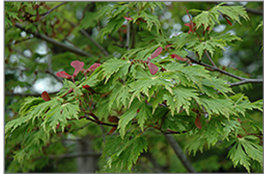
Maiku Jaku Fernleaf Full Moon Maple foliage