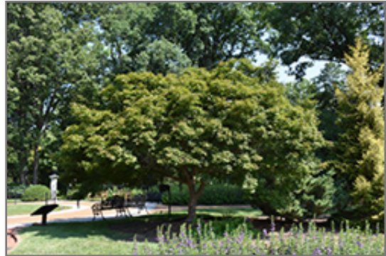
Trompenburg Japanese Maple

This tree does best in full sun to partial shade. You may want to keep it away from hot, dry locations that receive direct afternoon sun or which get reflected sunlight, such as against the south side of a white wall. It prefers to grow in average to moist conditions, and shouldn't be allowed to dry out. It is not particular as to soil pH, but grows best in rich soils. It is somewhat tolerant of urban pollution, and will benefit from being planted in a relatively sheltered location. Consider applying a thick mulch around the root zone in winter to protect it in exposed locations or colder microclimates. This is a selected variety of a species not originally from North America.