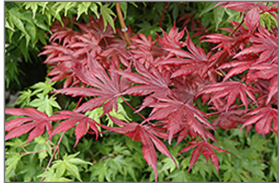
Trompenburg Japanese Maple foliage

Trompenburg Japanese Maple is recommended for the following landscape applications;