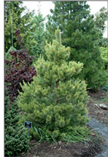
Gold Coin Scotch Pine

Gold Coin Scotch Pine is recommended for the following landscape applications;