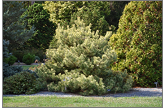
Gold Coin Scotch Pine

This tree should only be grown in full sunlight. It prefers dry to average moisture levels with very well-drained soil, and will often die in standing water. It is considered to be drought-tolerant, and thus makes an ideal choice for xeriscaping or the moisture-conserving landscape. It is not particular as to soil type or pH. It is highly tolerant of urban pollution and will even thrive in inner city environments. This is a selected variety of a species not originally from North America.