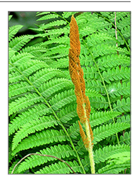
Cinnamon Fern flowers