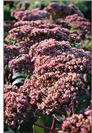
Maestro Stonecrop flowers

Maestro Stonecrop is recommended for the following landscape applications;