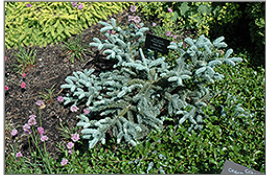
Prostrate Blue Noble Fir

Prostrate Blue Noble Fir will grow to be about 18 inches tall at maturity, with a spread of 6 feet. It tends to fill out right to the ground and therefore doesn't necessarily require facer plants in front. It grows at a slow rate, and under ideal conditions can be expected to live for 70 years or more.