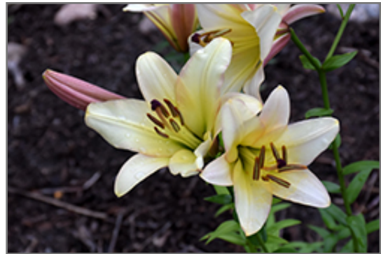
Silky Belles Lily flowers