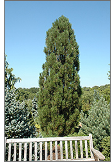
Arnold Sentinel Austrian Pine