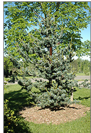
Short-Needled Japanese Blue Pine