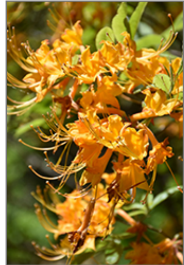
Florida Flame Azalea flowers