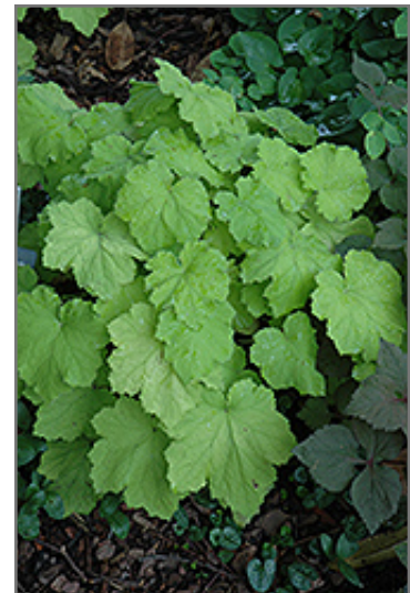
Pistache Coral Bells