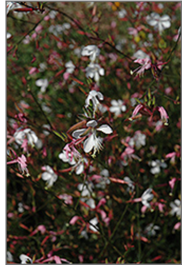
Snowstorm Gaura flowers

Snowstorm Gaura is recommended for the following landscape applications;