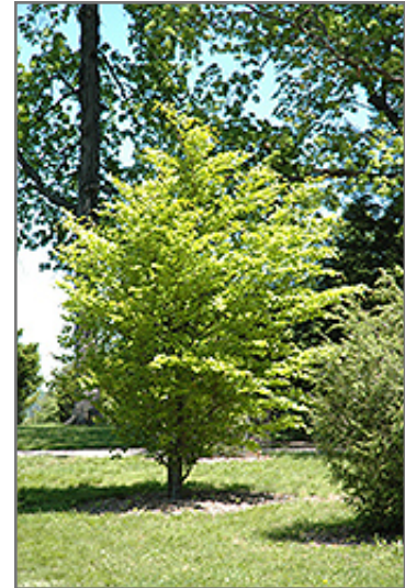
Golden Beech