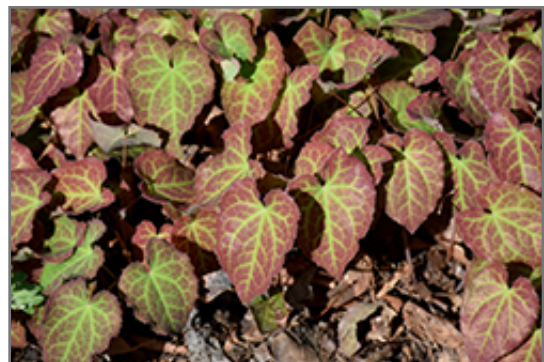
Froehnleiten Bishop's Hat foliage