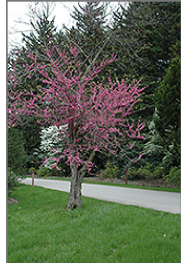
Pinkbud Redbud in bloom