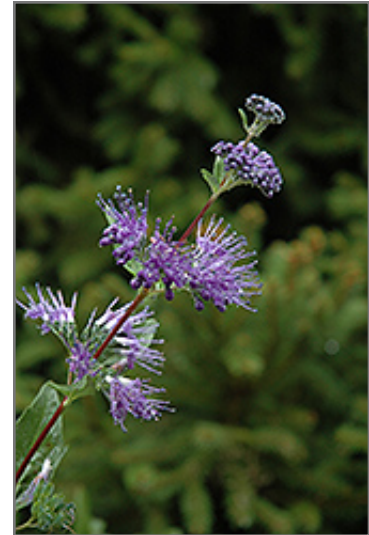
Blue Mist Caryopteris flowers