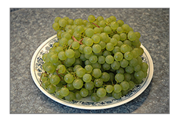
Morden 9703 Grape fruit