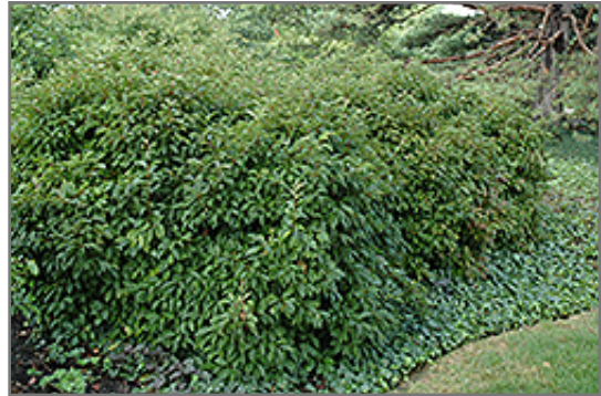
Dwarf Fragrant Viburnum