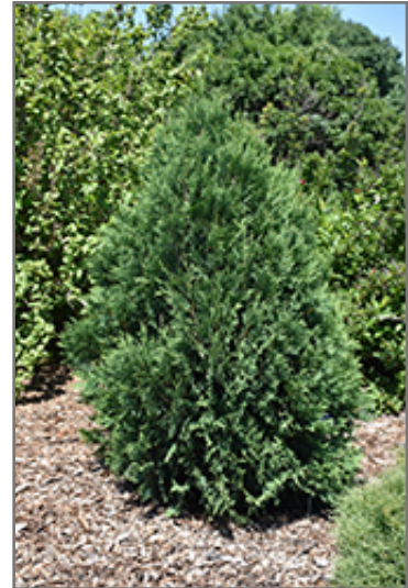
Technito Arborvitae