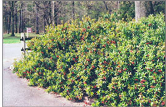
Wavy-leaved Chinese Stranvaesia fruit

Wavy-leaved Chinese Stranvaesia is recommended for the following landscape applications;